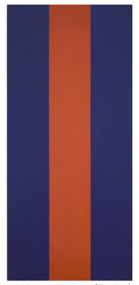
Figure 1. Barnett Newman. 1967. Voice of Fire. Acrylic on canvas. The National Gallery of Canada/NGO, Ottawa, Canada. Printed with express permission from the NGO.