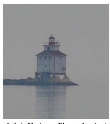
Figure 5. Safe Harbour.

Letters are created over time, words are chosen, thought about, read and re-read, and troubled with, creating meaning and order; a sort of sensibility. With courage, we send our letter off, we mail it as an act of giving. Once received and read, ideas are considered and thought about and the process of responding begins again (act of receiving). Collegial letter writing as a form of reflective practice is a means for examining the relational self, context, and history while providing the opportunity for sharing the challenges, difficulties, and achievements of everyday professional life allowing for making sense of difficult situations within practice moments (Pithouse-Morgan et al., 2012). We used the art of letter writing, metaphor, and literature (aesthetic perspective) to break open our ideas about transition as essential to the development of a compassionate practitioner. This paper was an invitation to our readers to join us in the 'introspective and reflective space' of letter writing to unpack lived experiences and explore the concepts of compassion, transition and relational being in their own practice in the classroom or care environment. The metaphor of sailing was a way for us to explore our journey from certainty to uncertainty, and back again. Relational Inquiry is the compass that guides our way of imparting principles, which both students and teachers can commit to and live by.