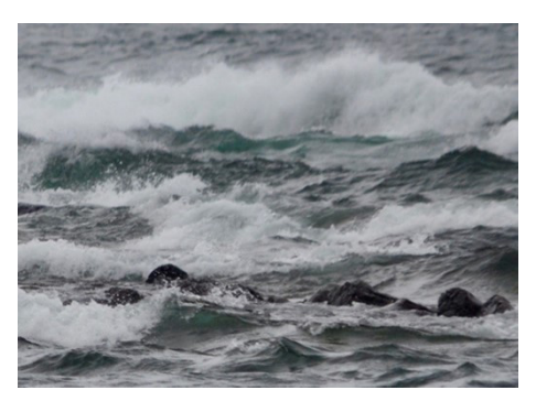
Figure 4. Storms Blow In.

lived experience of the intrapersonal, interpersonal and contextual dimensions of teaching life. To write letters to each other as teachers opens up the possibility of creating deeper meaning beyond that of verbal communication, because time and space are enacted. We are not talking on the phone or texting back and forth: there is no immediacy.