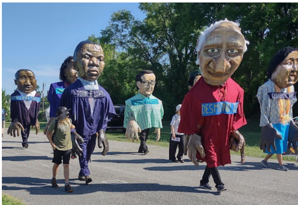
Figure 1. Martin Luther King Jr. Parade